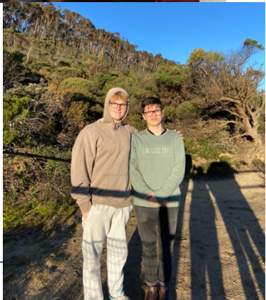
Some photos at the weekend Christian Camp, KYCK!