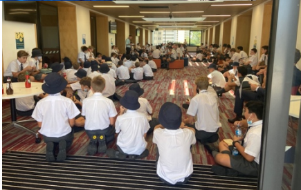
A CU meeting, we have over 100 boys consistently!