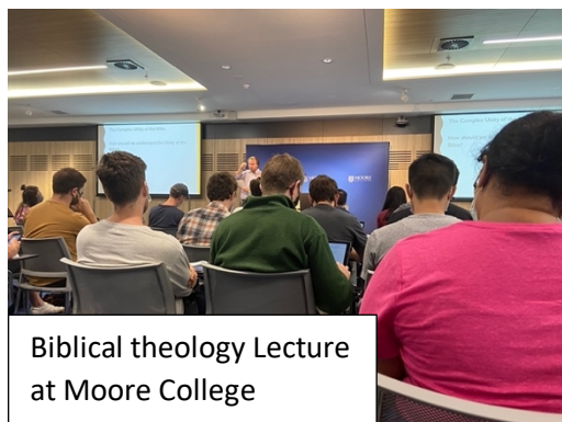
Biblical theology Lecture at Moore College

In the last couple months, I have started football coaching at St Andrews Cathedral School, this has been a fantastic opportunity and a great way to spend a Monday, Tuesday and Thursday afternoon. The boys are very easy to coach and so this makes it an enjoyable experience, the weather has made it slightly more tedious as it was the wettest March in 150 years. Please pray that I would be bold to share my faith with the boys.