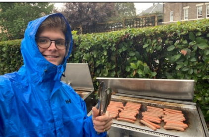
Doing a barbie for the CU at Shore School in the pouring rain!!!

Then on Friday I attend Shore school, where I help out with their Christian Union, and also sit in on some of the Christian studies lessons. This has been hard getting to know the boys as they have such an irregular timetable and because there is so many coming to the meeting each week. Please pray for endurance as it is challenging trying to build relationships. Praise God for the numbers who attend the CU.