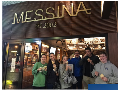
Going to Messina with the Wednesday night bible study group as a social