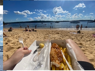
A day off visiting Watsons bay with a fish and chips lunch