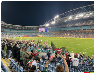
I went to a South Sydney Rabbitohs game, where I met Sonny Bill Williams.