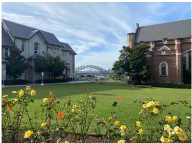
The views from the school!

Then on Friday I attend Shore school, where I help out with their Christian Union, and also sit in on some of the Christian studies lessons. This has been hard getting to know the boys as they have such an irregular timetable and because there is so many coming to the meeting each week. Please pray for endurance as it is challenging trying to build relationships. Praise God for the numbers who attend the CU.