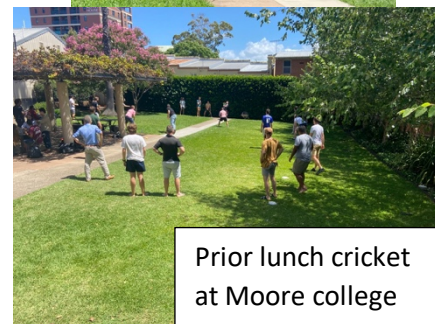
Prior lunch cricket at Moore college