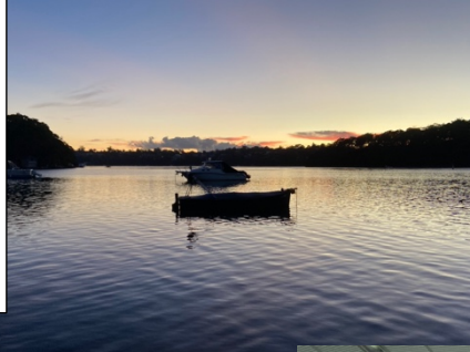
Staying with a family from the Cathedral for the Easter weekend, they live in the most beautiful location, Grays Point. They are so lovely and have been such a blessing to me, I really enjoyed spending time with them.