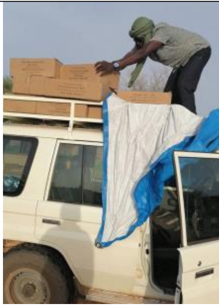
A 4x4 is loaded with Bibles in Niger

Ever since Bible Society was founded 217 years ago as The British and Foreign Bible Society, its two aims have been: (1) through translation, to make the Word of God available to people in their own heart language, and (2) to enable the Bible to speak in a contemporary and relevant way within our own culture. Here are examples of how these two aims are being met today.